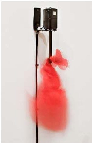
Chad Kleitsch "Jungle Jam," by the Brazilian collective Chelipa Ferro.

A more streamlined take on carnival aesthetics is offered by Chelipa Ferro , a Brazilian artist collective ("chelipa ferro" is Portuguese slang for "money and steel"). The group's "Jungle Jam," from 2011, uses colorful plastic bags attached to kitchen-blender-motors lined up around the gallery wall and controlled by a computer program to create a swishing composition. Here, the visceral rhythms of Brazilian music and the colorful, wearable parangolés of Hélio Oiticica (1937-80), which were often donned by dancers, are turned into a sleek technological expression.