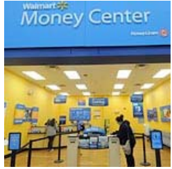
High Bank Fees Give Wal-Mart a Money Aisle