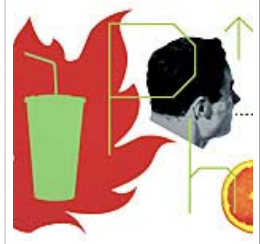
Tired of Feeling the Burn? Low-Acid Diet May Help