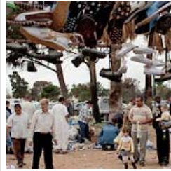
Ex-Lair of Tyrant, Now Just Any Place