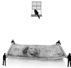
Op-Ed: End Bonuses for Bankers