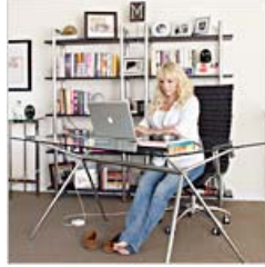
Inside Meghan McCain's Bachelorette Pad