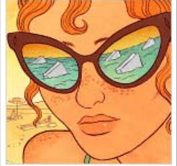
Books to Bury Yourself In

Home | World | U.S. | N.Y. / Region | Business | Technology | Science | Health | Sports | Opinion | Arts | Style | Travel | Jobs | Real Estate | Autos | Site Map