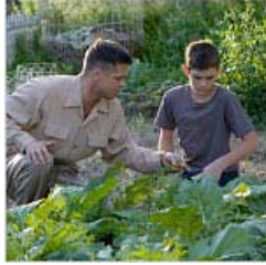
Heaven, Texas and the Cosmic Whodunit