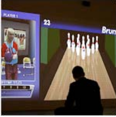
A Muse in the Machine: Click. Create.