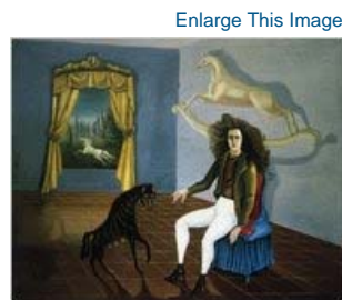
Enlarge This Image