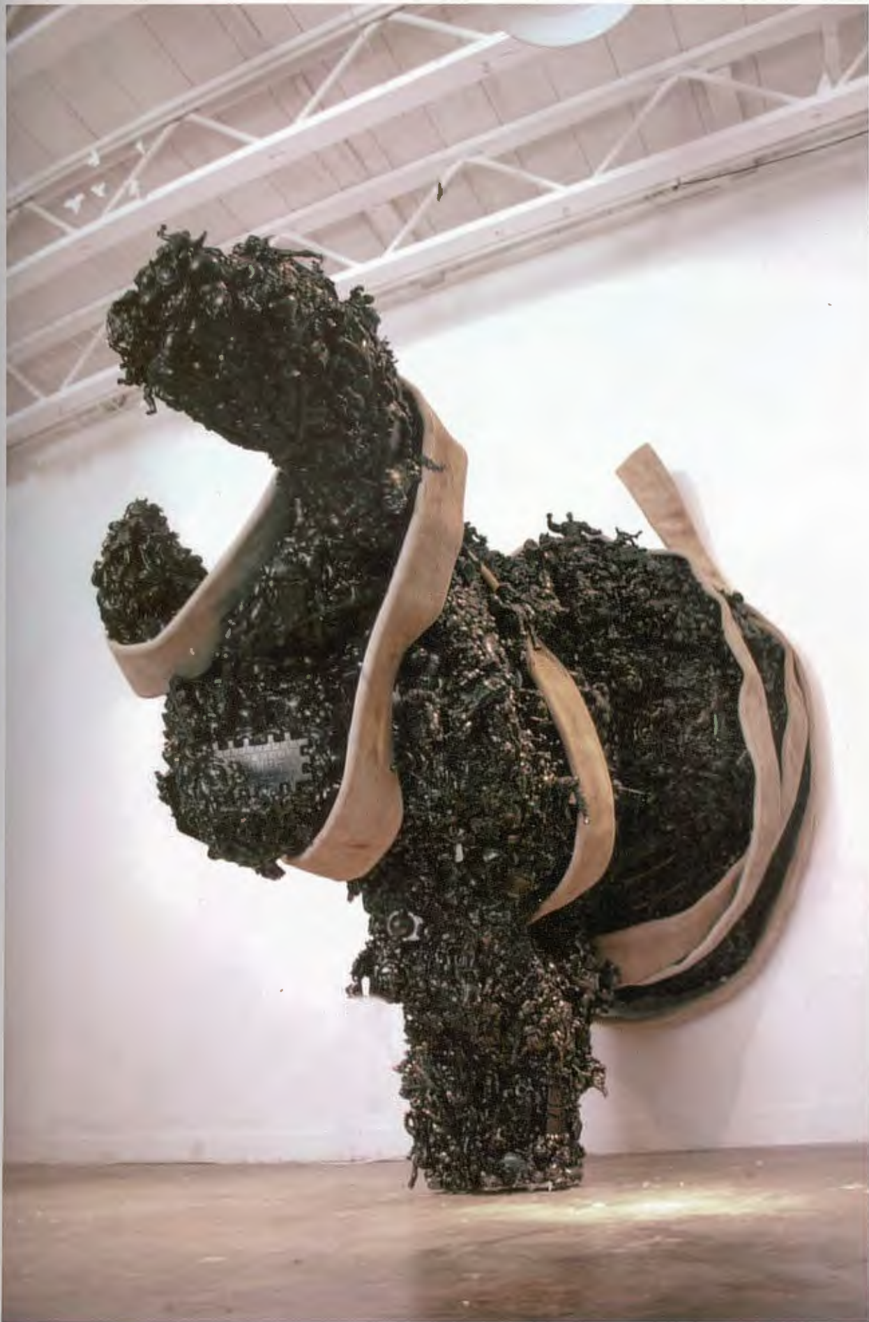
Fossilizing Towards, The Name Engorged by Capillarity Installation & Sculpture Finalist, Sculpture, 91.5x168x213cm, 2010