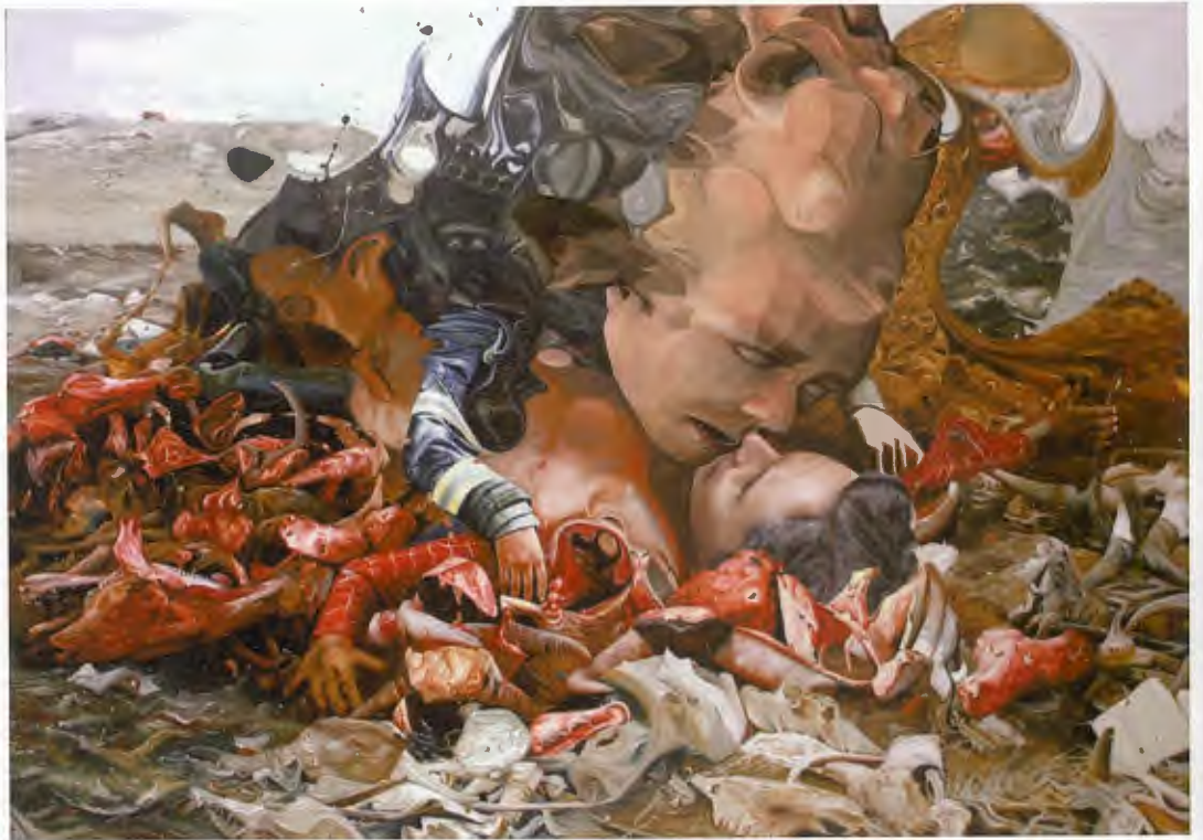
The Mind Recedes the Blood is Wise the Soundless Mouth is Open Painting, Mixed technique, Canvas, 279x198cm, 2010