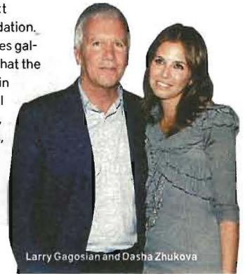
Larry Gagosian and Dasha Zhukova