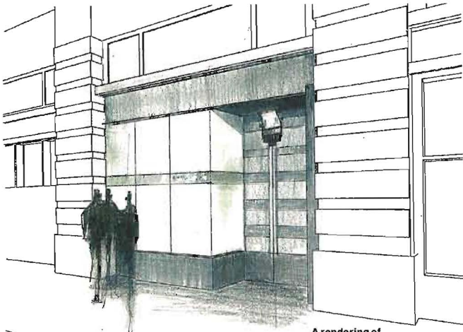
A rendering of Frey Norris Gallery